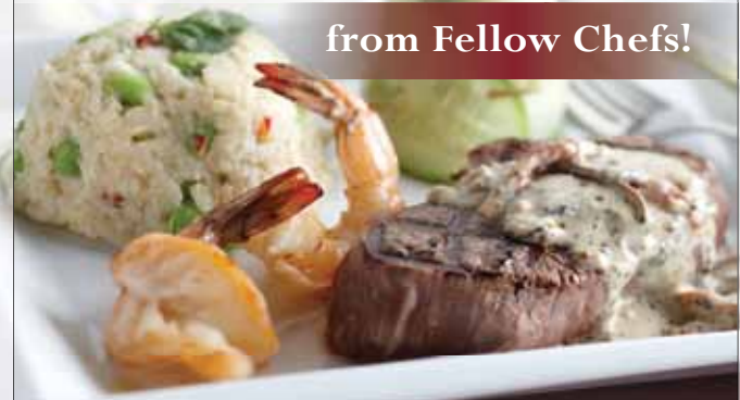
Steak & Shrimp with Edamame Risotto and Sinatra Sauce